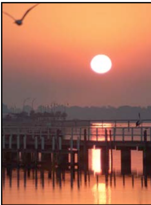
Sunrise Lakes Entrance